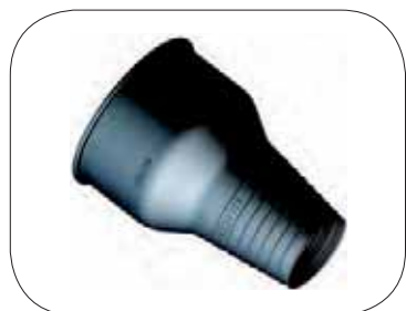
Silicone Wrist Seals: 61025