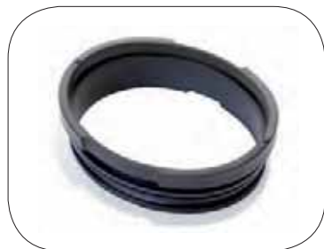
Oval Stiff Ring: 60260