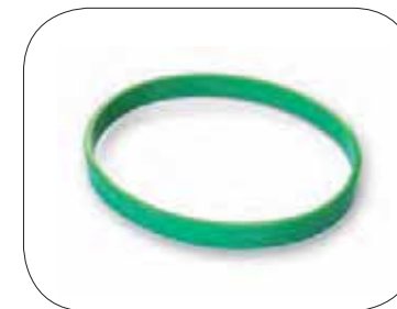
Oval Spanner Ring (green): 60264