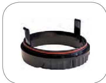
Oval Glove Ring: 60261