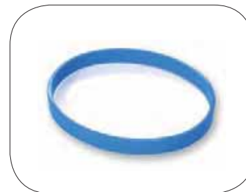
Oval Spanner Ring (blue): 60263