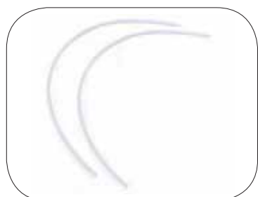
Pressure Equalization Tubes: 60233